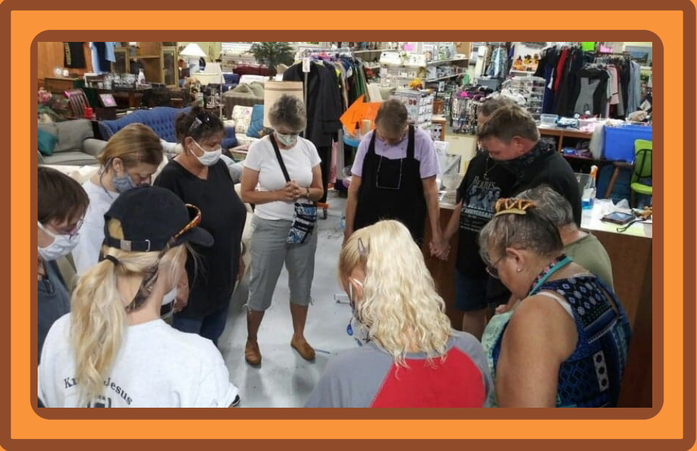
Thrift Store Team Praying Before Work