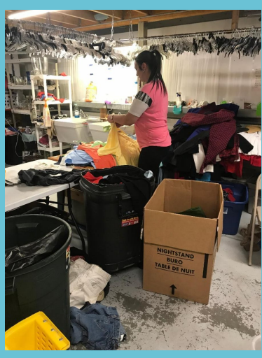
Resident Prepping Clothes

We want to SHOUT OUT a huge THANK YOU to the Women of Sugarmill Woods for your love and support! Pictured to the left is a Wood Splitter recently purchased from a generous donation from The Women of SugarMill Woods.