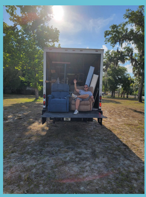
A moment of light-hearted fun to say "howdy" before unloading the truck for our Sanctuary Mission Yard Sale.

"Therefore if any man is in Christ, he is a new creature: old things are passed away; behold, all things are become new."