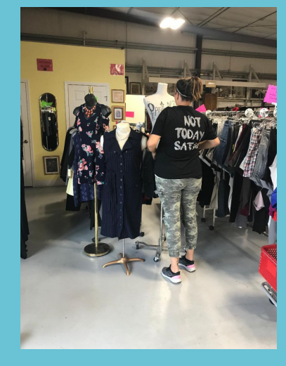
Our ladies serving In the Thrift Store